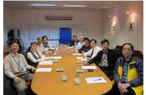
Hong Kong Chapter is established on 25 February 2011