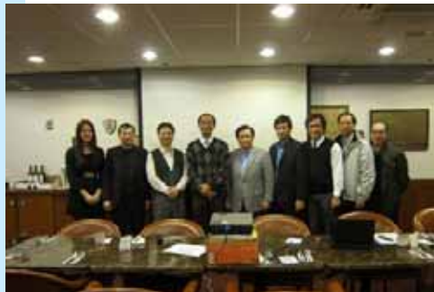
1 st Annual General Meeting on 21 January 2011

President, 2 Vice Presidents, 6 Board Members, Treasurer and Secretary are elected in the 1st Annual General Meeting on 21 January 2011.